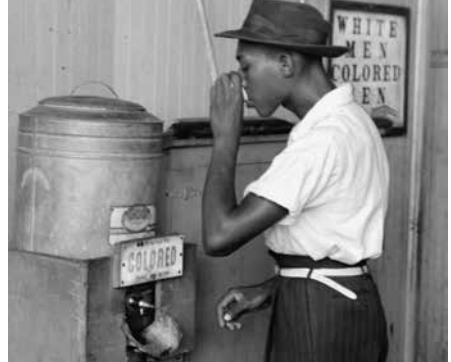
An African American man drinking at a colored water cooler in Oklahoma City, OK, 1939. Courtesy of the Library of Congress, LC-DIG-fsa-8a26761.

Until 1920, women were not allowed to vote in political elections. This image shows two women petitioning for the right to vote (ca. 1917) in New York State. Courtesy of the Library of Congress, LC-USZ62-53202