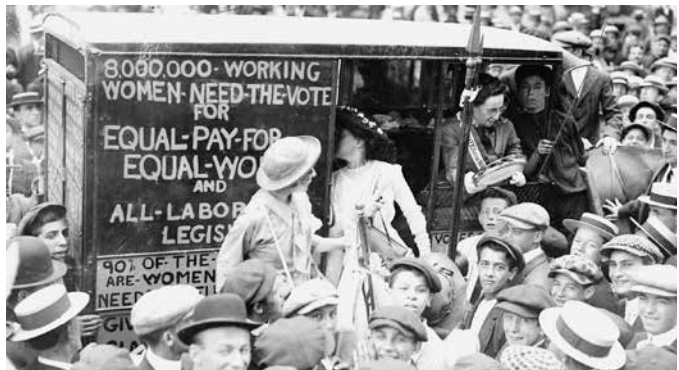
Women on their way from New York to Boston in 1914. Courtesy of the Library of Congress, LC-DIG-ggbain-13711.