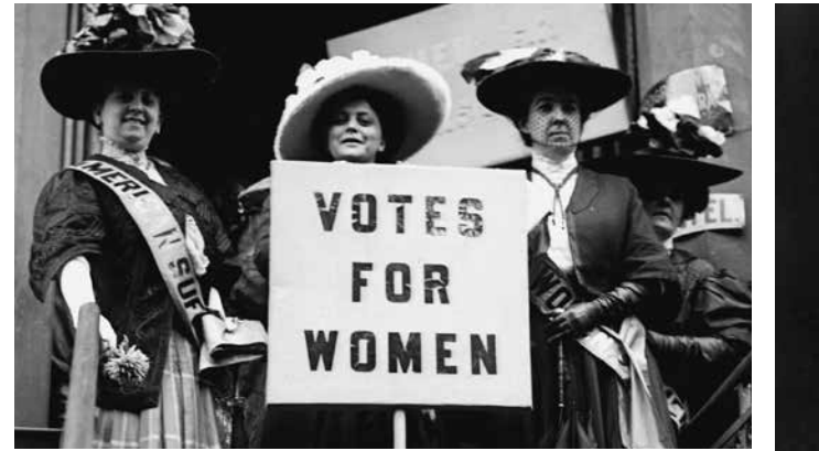
Women demonstrating in New York in 1908. Courtesy of the Library of Congress, LC-DIG-ggbain-02466.