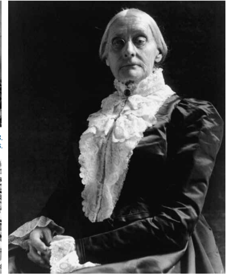
Susan B. Anthony Courtesy of the Library of Congress, LC-USZ62-83145.