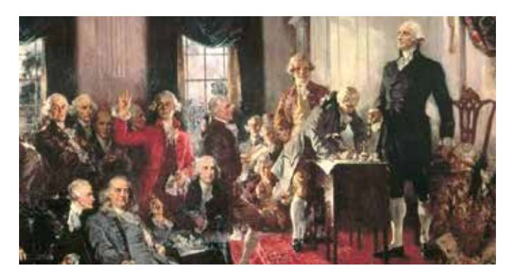
Scene at the Signing of the Constitution of the United States by Howard Chandler Christv.

Courtesy of the Library of Congress, LC-USA7-34630.